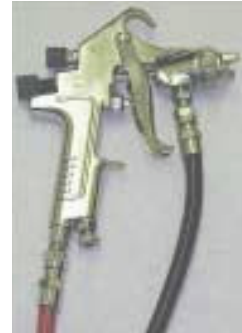
BRP HVLP spray gun fitted with VOW type twin hose & stainless steel 76 series reusable connections (page 6)